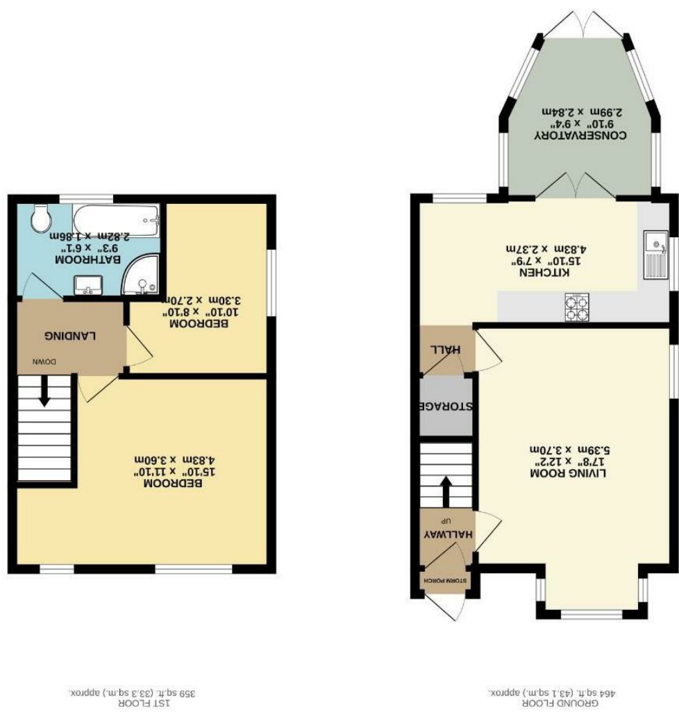
1ST FLOOR 359 sq.ft. (33.3 sq.m.) approx.

TOTAL FLOOR AREA: 823 sq.ft. (76.4 sq.m.) approx. Measurements are approximate. Not to scale. Measure purposes only. Floor: 1st Floor, 2nd Floor